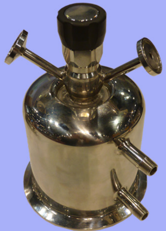
Vessel with bottom Valve, 2 outlets