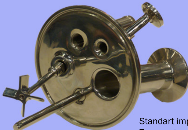
Standart impeller and long Temperature sleeve holder